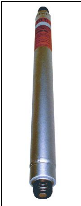
STITT Extended Barrel Spark Plug S-AGR18LLBEX17-2

that exceed the UL maximum recommended operating temperature for this material when it is first put into service in an engine. If that assertion is doubted, then we suggest that the operators of these engines review UL 764A,B,C. This is an ANSI standard incorporating a TEMPERATURE INDEX FOR POLYMERIC MATERIALS.