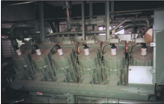
Waukesha VHP4 With Factory Configuration