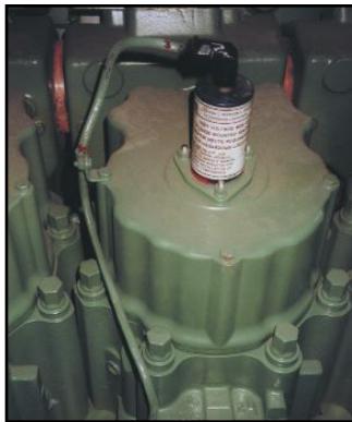
Factory Selected Components TABLE A

engine production costs and excessively higher engine operating costs