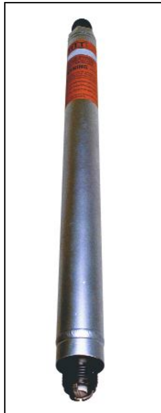
STITT Extended Barrel Spark Plug S-R807LLBEX17-2

mary connectors to the ignition coil will be eliminated. And this is a distinct improvement in ignition system reliability and durability.