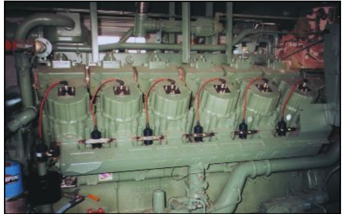
Waukesha VHP4 With STITT Configuration

For inexplicable reasons, recent engine series from a number of manufacturers have been introduced with what we would label as “user-unfriendly” ignition configurations. These configurations are commonly identified as either valve